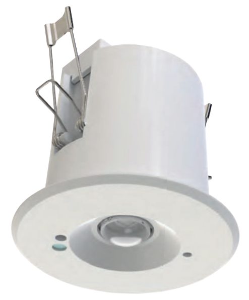
Indoor Recessed PIR Sensor AOCTO/BT/PIR-R