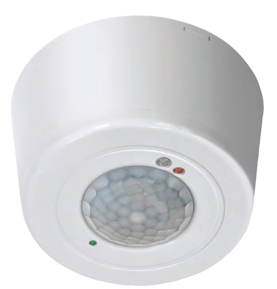
Indoor Surface PIR Sensor AOCTO/BT/PIR-S