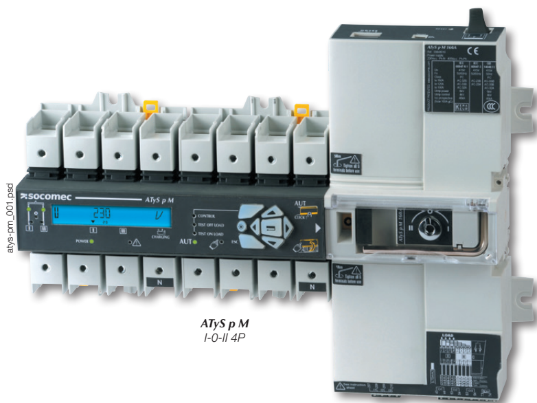
ATyS p M I-O-II 4P

Automatic Transfer Switching Equipment from 40 to 160 A