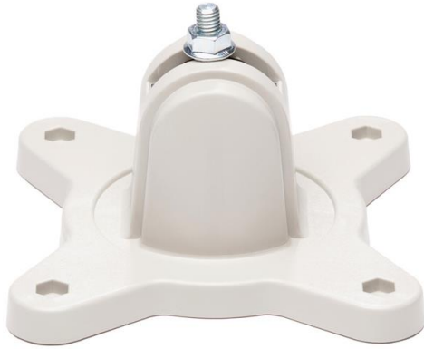
Figure 5 Universal Bracket (for use with detector head and prism mounting plates)