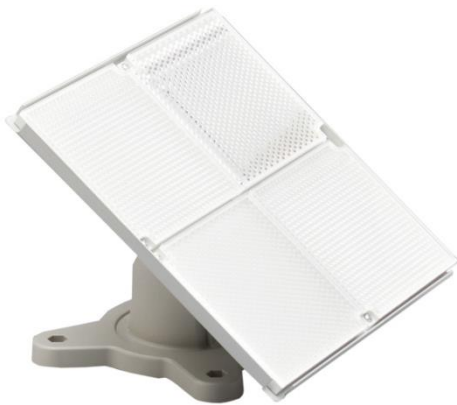
Figure 3 Prism Mounting Plate (4 prisms 50-100m)