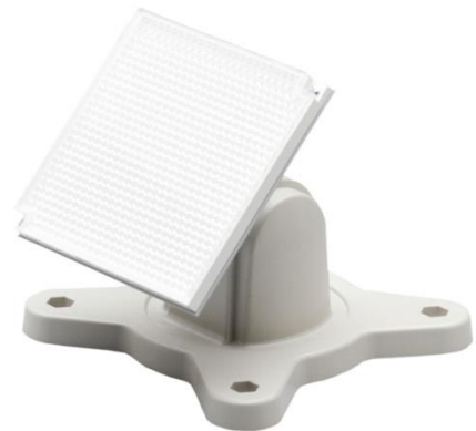
Figure 2 Prism Mounting Plate (1 prism 18-50m)