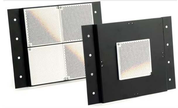
Figure 4 Surface Mounting Plate for prisms