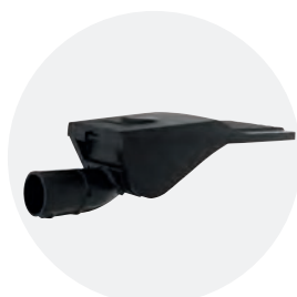
Side entry utility 76mm spigot