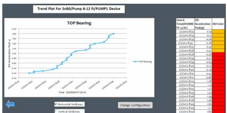
Sample trend plot using the Fluke 805 trending template.