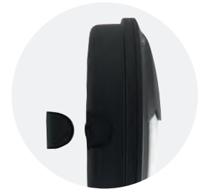
Removable 20mm conduit entry cover for ease of installation