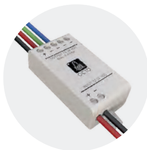
12-24VDC Power supply