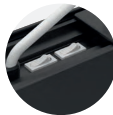
Integral switch allows installer the option of both bi-directional and/or directional light output