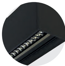
Reflector lens design ensures reduced glare and visual comfort