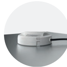
Panel Pod Emergency installed