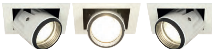
Fully retractable head with 360° rotation and 90° tilting capability