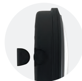
Removable 20mm conduit entry cover for ease of installation