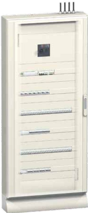
Prisma G 36-modules-height