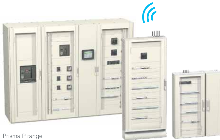
Prisma P range