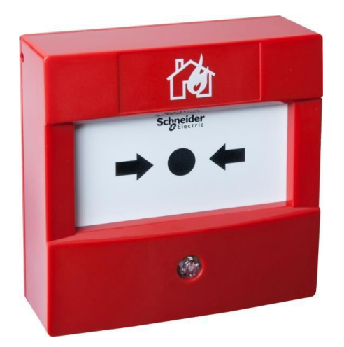
Figure 4 EPP-20A

Intellia EPP-20A (FFS06723700) is intended for indoor applications. surface mounted and they incorporate a short circuit isolator.