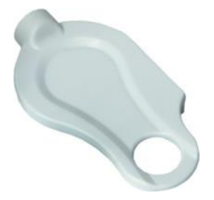
Figure 1 Reset key