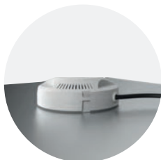
Panel Pod Emergency installed