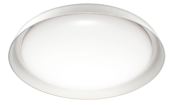
Plate | Decorative ceiling luminaires with WiFi technology