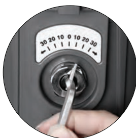
Adjustable 30° beam angle