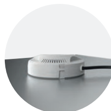
Panel Pod Emergency installed