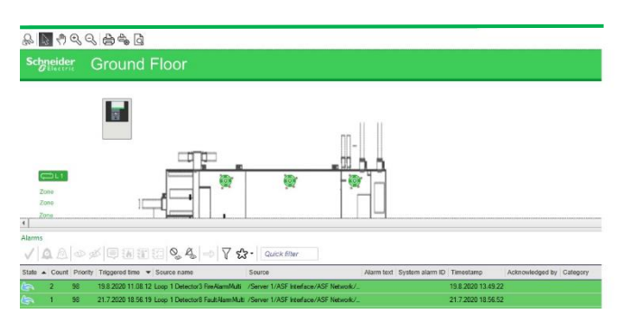
Figure: Fire elements on top of the floorplan

SmartDriver combined with EcoStruxure Building Operation (EBO) will offer an integrated view of the whole facility.